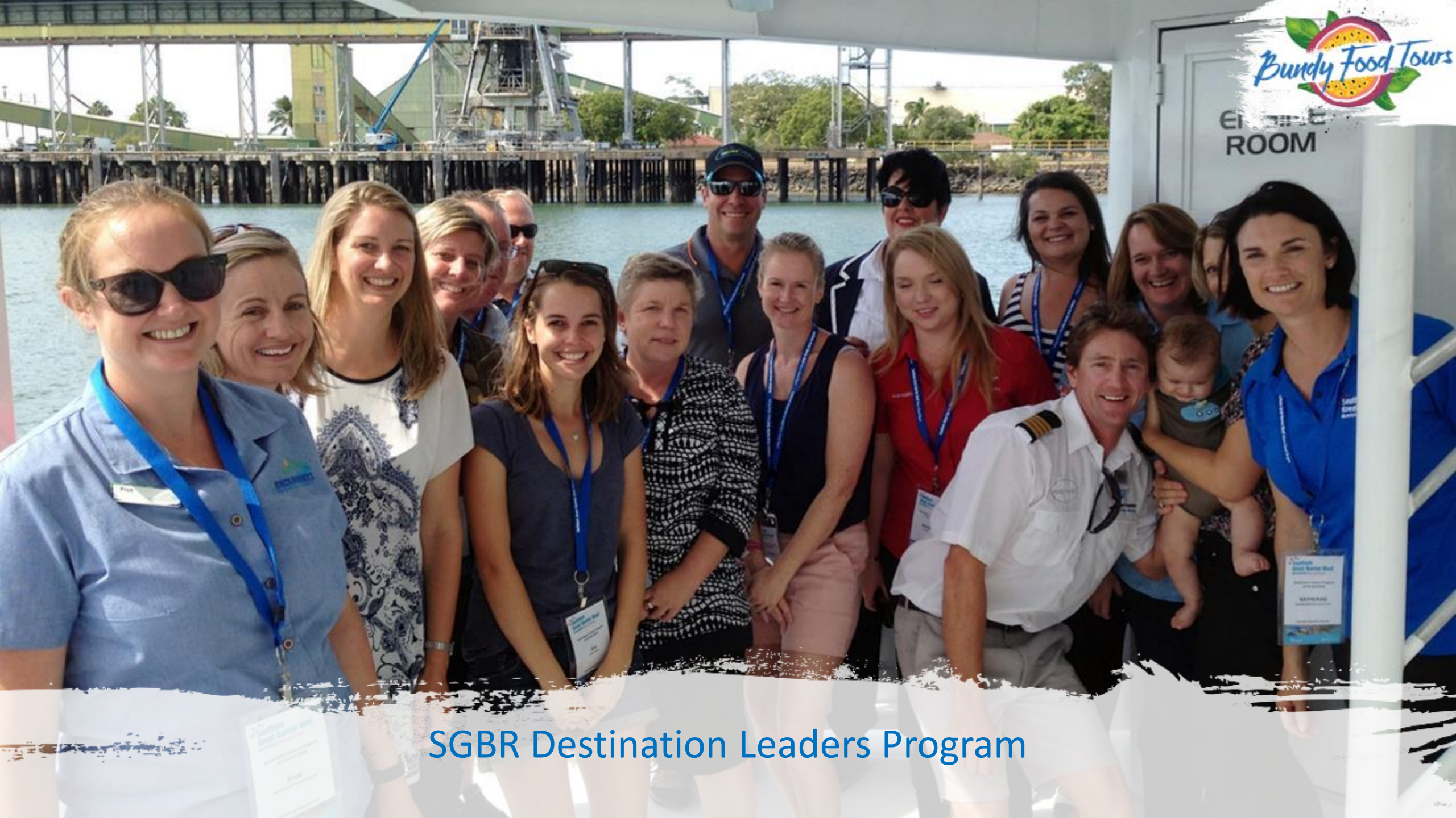
SGBR Destination Leaders Program