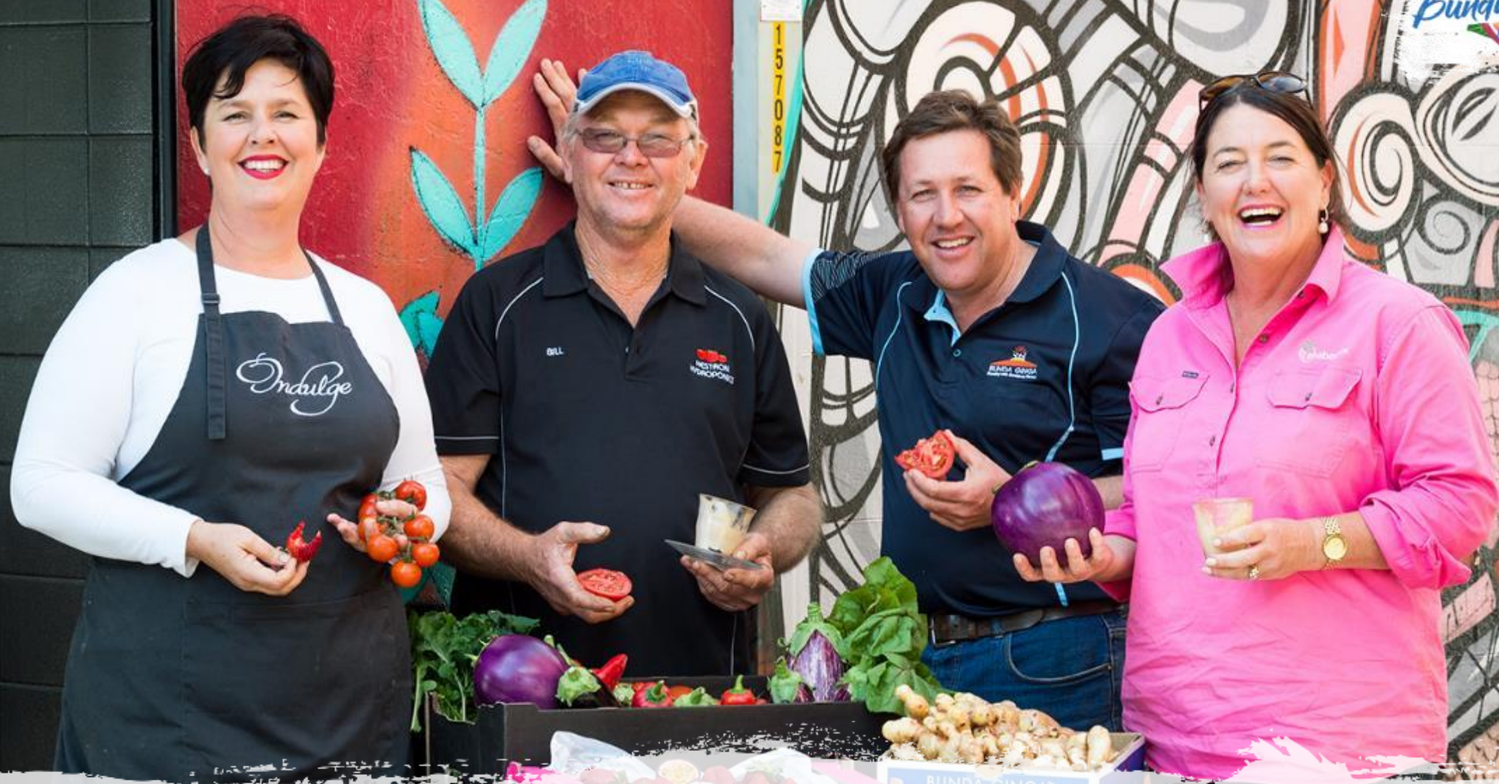
Culinary Tourism Internship at BNBT